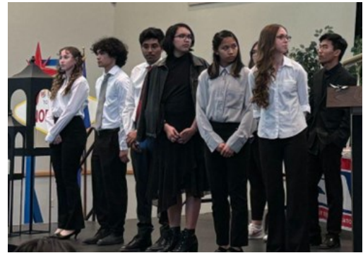
2024-25 TSA State Officers

As TSA concludes its second year in Nevada, the organization stands as a testament to the power of technology in shaping the future. Through its programs and initiatives, TSA continues to inspire and prepare the next generation of innovators, problem-solvers, and leaders in the ever-evolving landscape of technology.