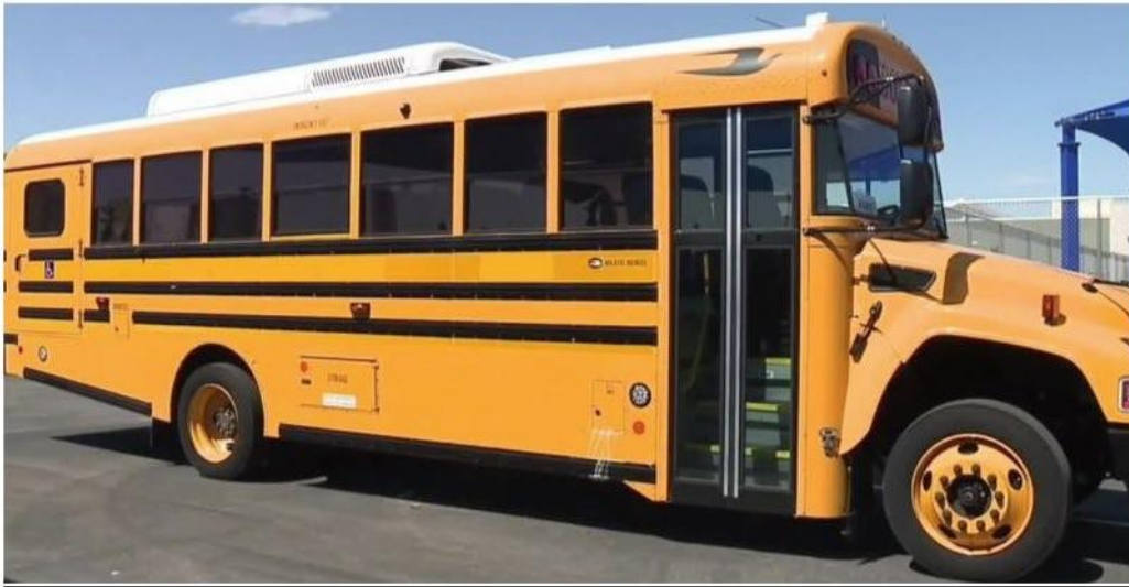
1 1/3" minimum school bus yellow (required)