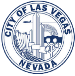
SHELLEY BERKLEY MAYOR