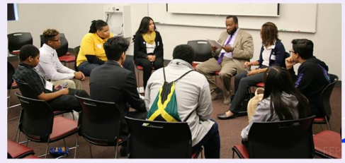
A Team works on the Entrepreneurial exercise with Adult Leader

"Your tax deductible contributions and inquiries are welcome." Please visit our website Uplift Foundation of Nevada (501c3) at: https://upliftfoundation-nv.org/