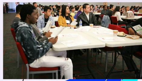
Students Listen to the Guest Speaker