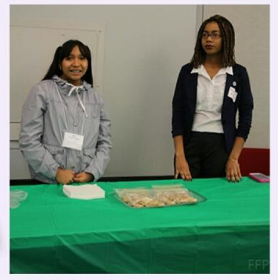
Students Staff Booth for their Business