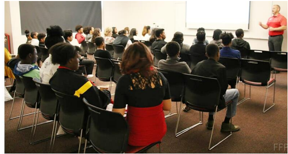
Financial Aid Workshop