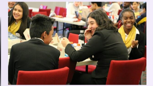
Students discuss events of the day

The two hundred 6th to 12th grade students and their parents in attendance were the beneficial recipients of a morning of engaging Workshops and an afternoon Entrepreneurial Group Exercise focusing on STEM, financial literacy and economics.