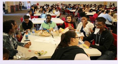
Students and Parents enjoy lunch