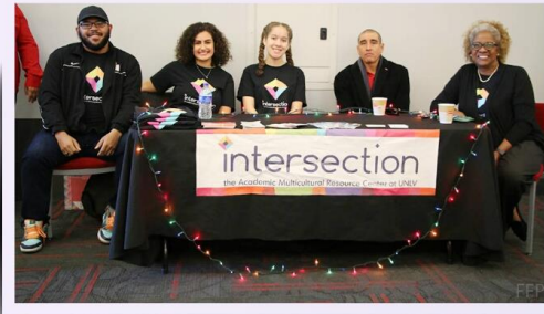
The Intersection Team of University of Nevada Las Vegas