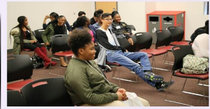
Students divided in Teams for afternoon Entrepreneurial exercise