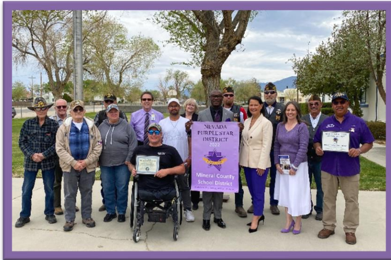
Mineral County School District