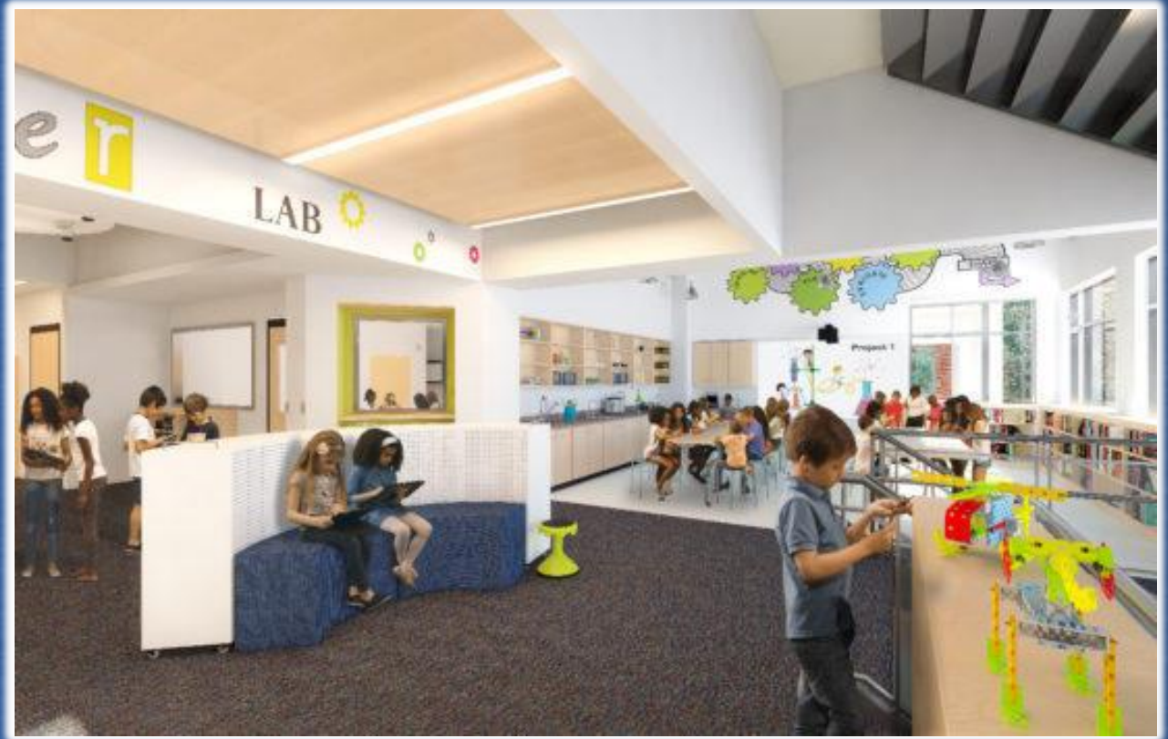
Where we are headed with EPIC Learning...