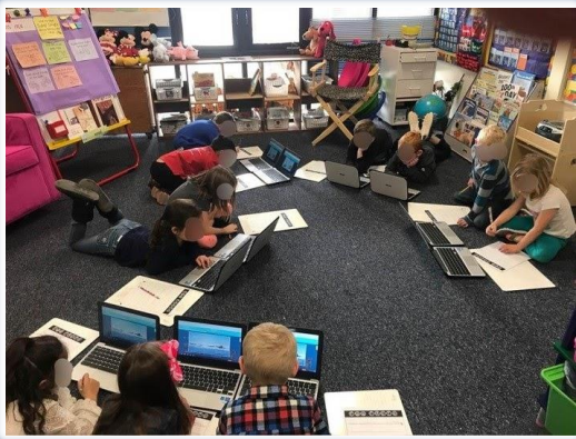
Where we are...