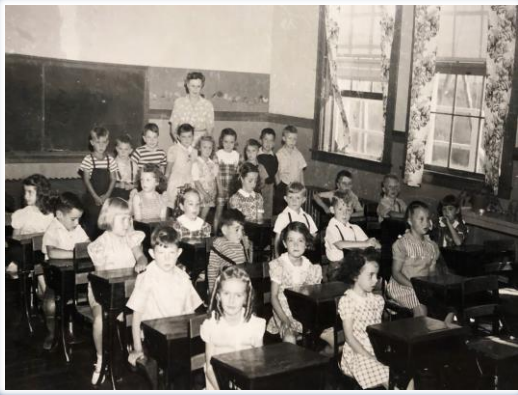
Where we were...