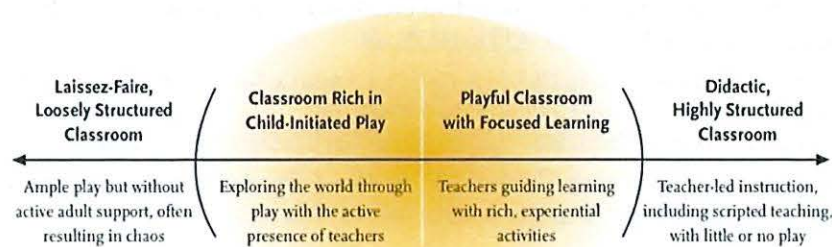
THE KINDERGARTEN CONTINUUM

These elements show up on a continuum as identified in the graphic below (Miller & Almon, 2009) with best practices finding the sweet spot in the middle.