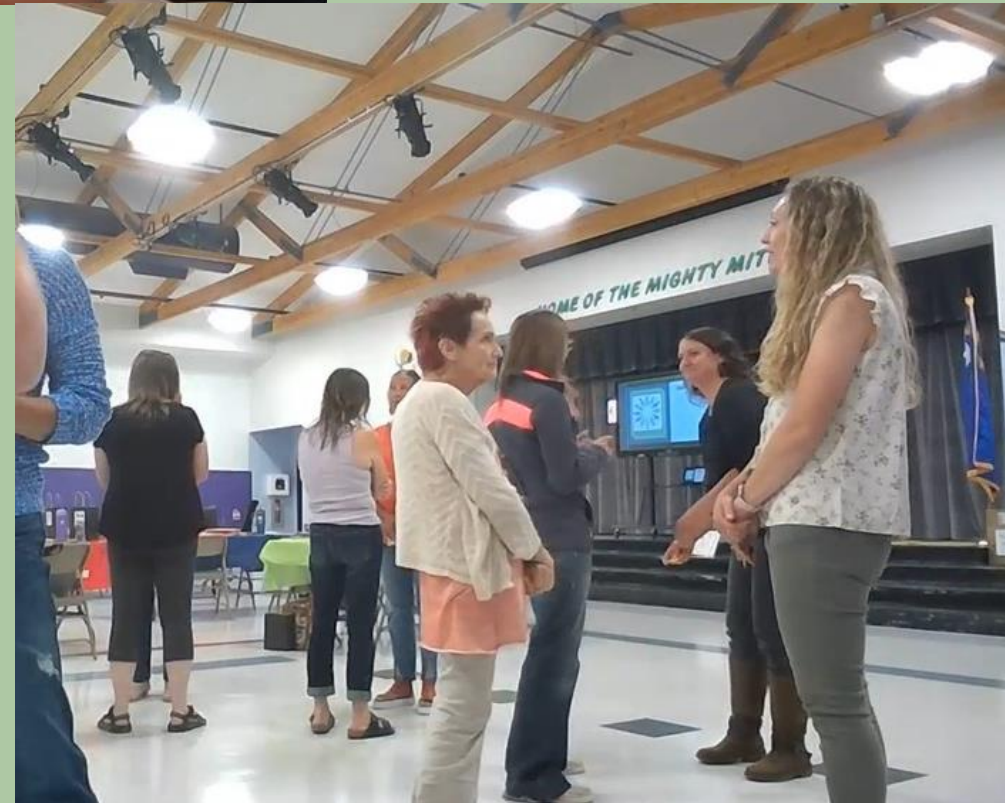
Student Centered Learning Activity Video