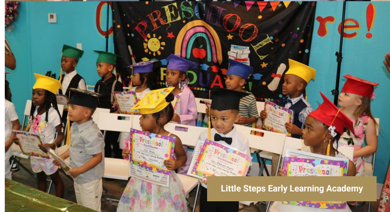
Little Steps Early Learning Academy