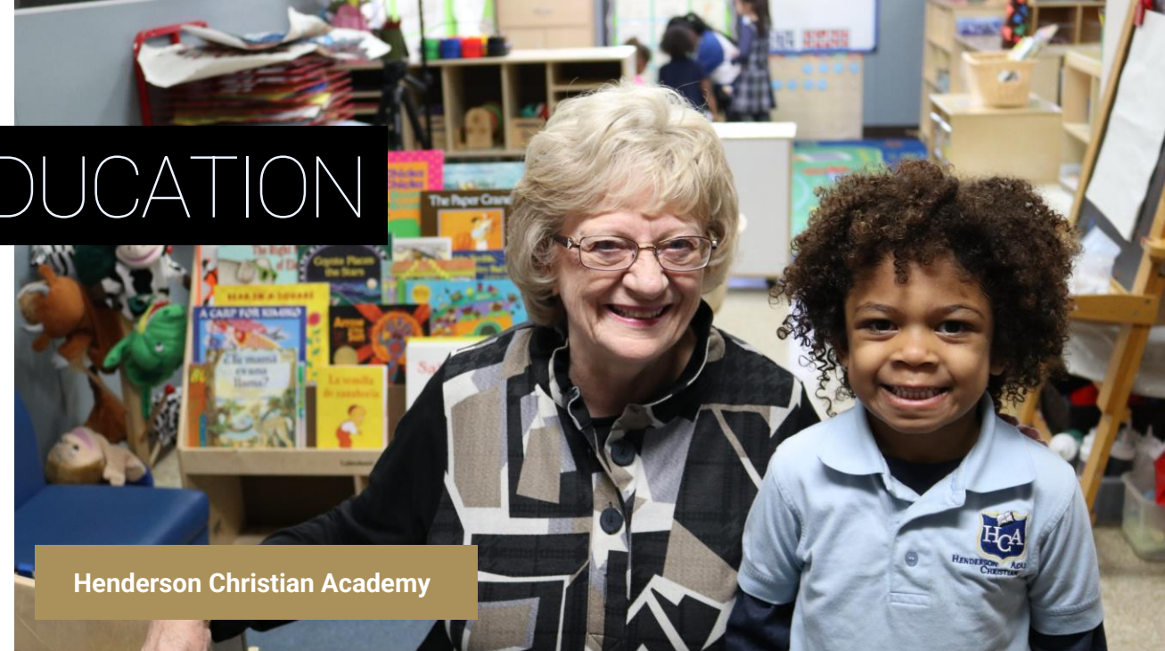
Henderson Christian Academy